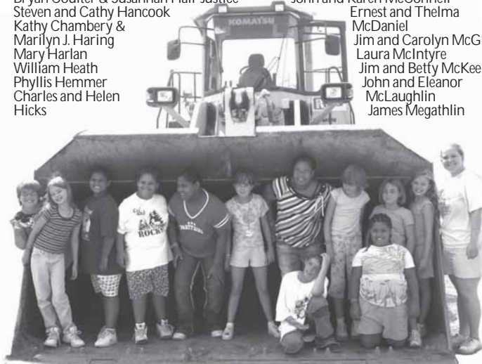
Camp kids visit a rock quarry