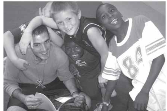
Campers participated in many outdoor activities including swimming (above), paddleboat rides, hiking, and lots of other fun.