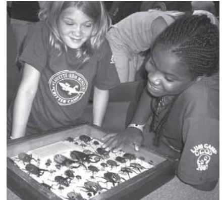
LUM campers were introduced to many different kinds of critters by Purdue entomologists and other wildlife experts. Children were able to visit with a large millipede (above), as well as an alligator, boa constrictor, hedgehog, skunk, and mounted bug specimens.